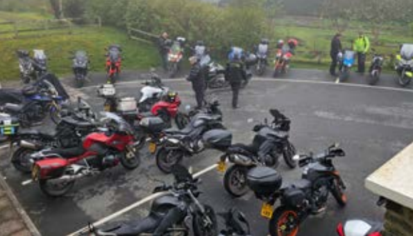
Getting ready for the off on a foggy Saturday morning