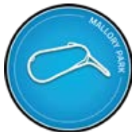
MALLORY PARK Length: 1.4miles Leicestershire