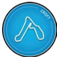
CROFT Length: 2.1miles County: Yorkshire