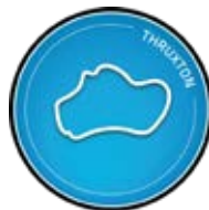
THRUXTON Length: 2.4miles Hampshire