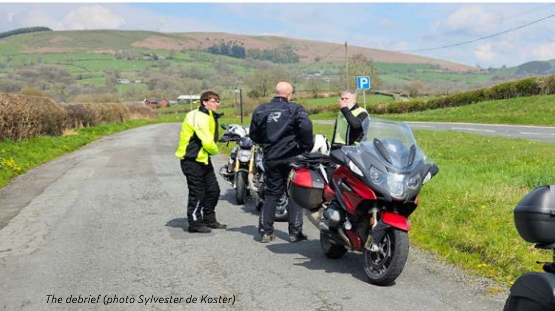
The debrief