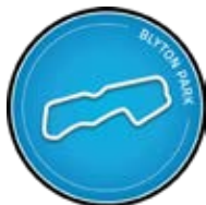
BLYTON PARK Length: 1.6miles Lincolnshire