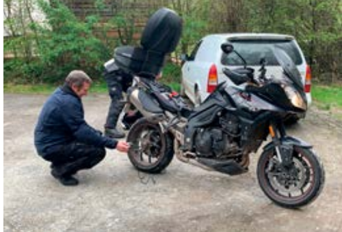
Repairing the puncture

grouped with for the Friday and Saturday rides. I always get a lot from shadowing and the combination of learning from highly skilled TVAM Observers, watching keen Associates develop and experience some of the very best roads in the UK, made it an excellent weekend for me. The emphasis of enjoying the rides was constantly reinforced by everyone in the training team and the vibes I got from the weekend were really positive and relaxed. I enjoyed great company, made new friends, experienced awesome scenery and rode some really beautiful Welsh roads.